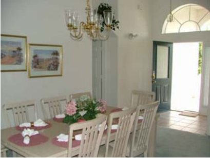
The Family dining Room