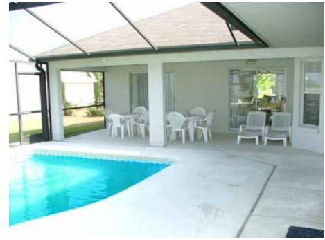
Swimming pool and Lanai